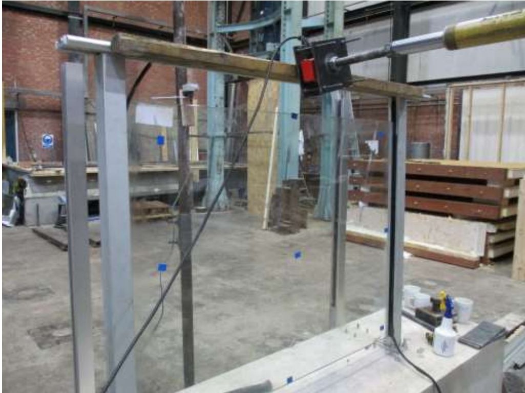
Plate 1 - Test Arrangement